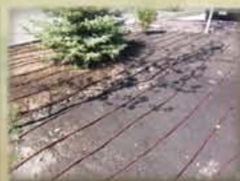
Solar powered, underground drip irrigation.