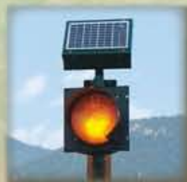
Solar powered beacons on street signs.