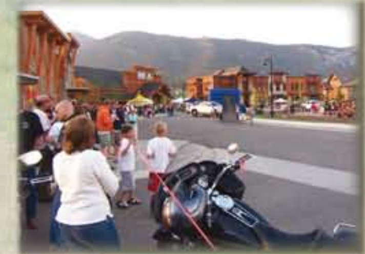
Motorcycle Roundup held at Town Center June 2008.