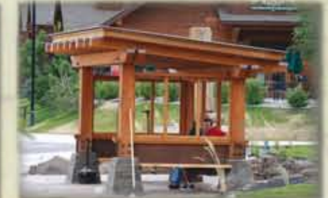
Town Center bus shelter.